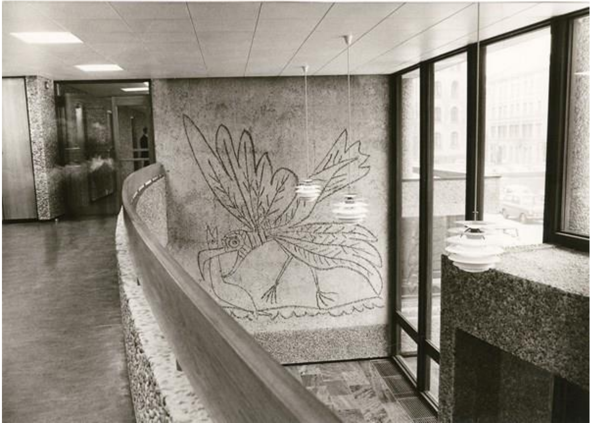
Erling Viksjø, Interior, Y-block, Government Quarter, c. 1970.

International Scientific Committee on Twentieth Century Heritage