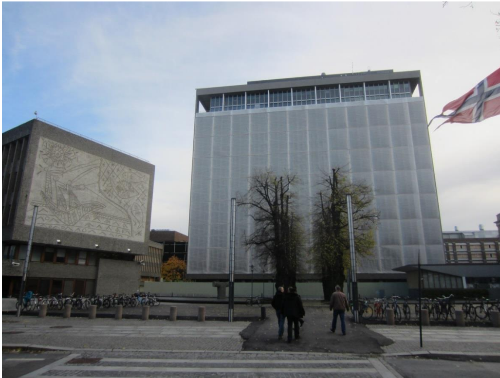
Y-block and H-block, 2014

International Scientific Committee on Twentieth Century Heritage